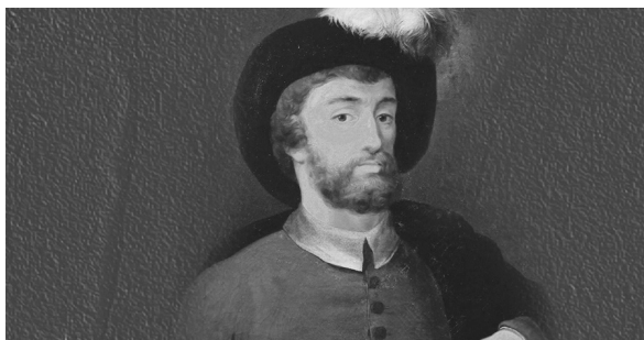
1 Juan Sebastian Elcano Spanish explorer and sailor _____